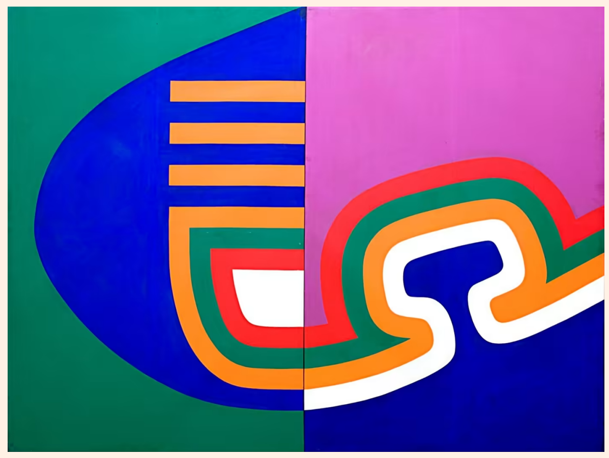
Untitled (1975) by Mohammed Chabâa

The Casablanca Trio forms the core of a richly fascinating but frustratingly arranged exhibition