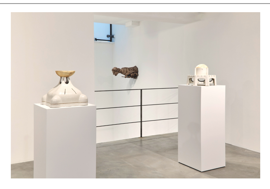
We Owe This Considerable Land to the Horizon Line, 2017