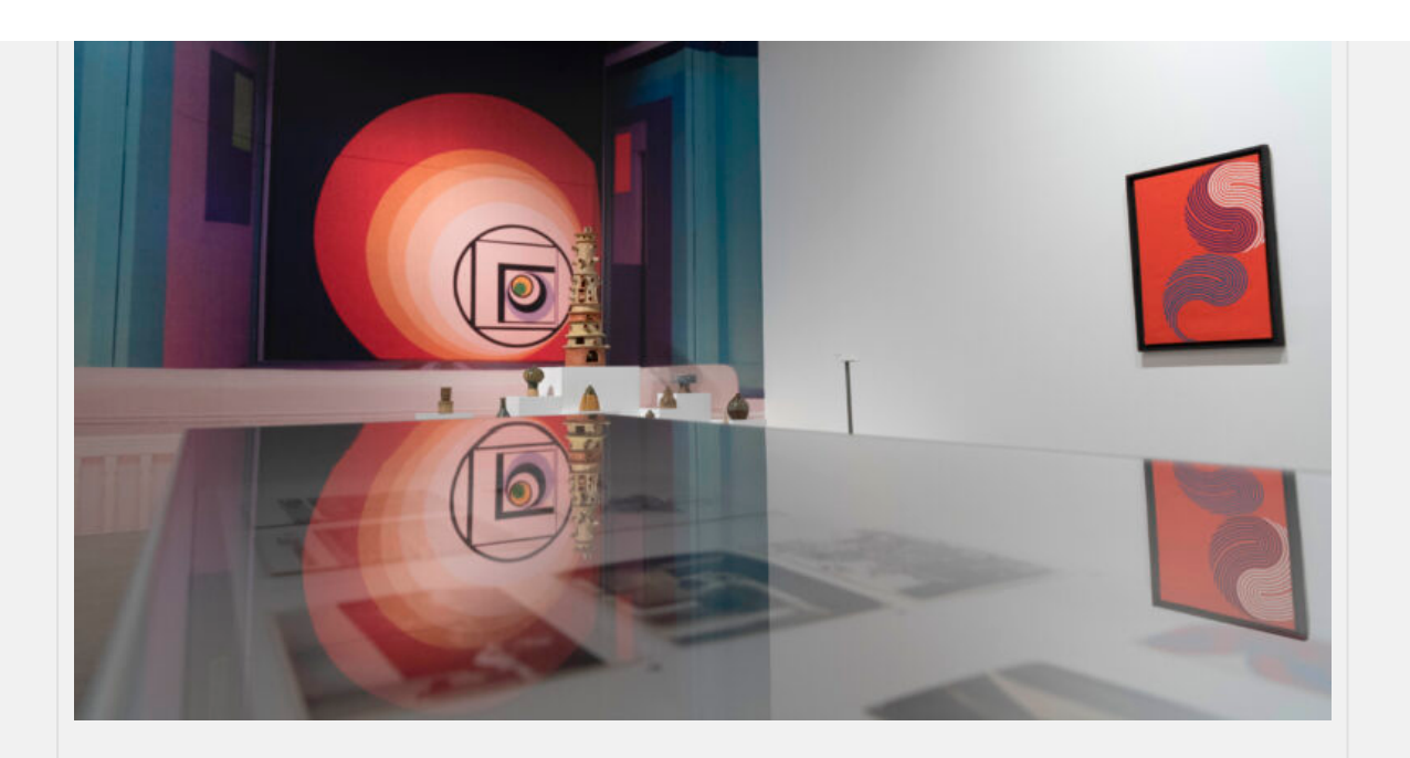
Casablanca Art School, Installation View at Tate St Ives, 2023