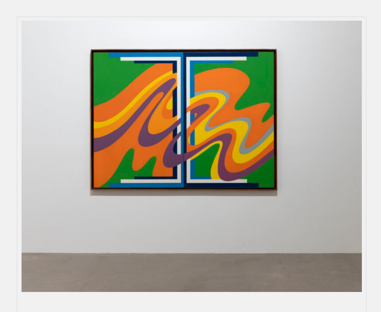
Casablanca Art School, Installation View at Tate St Ives, 2023, Photo Oliver Cowling / Tate

The Casablanca Art School's revolutionary approach proposed a bold new visual culture following Morocco's independence in 1956. Reflecting a new social awareness, artist-professors including Farid Belkahia, Mohammed Chabâa and Mohamed Melehi transformed this institution by encouraging artistic experiments, looking beyond Western academic traditions and drawing on existing local culture. This exhibition will explore how the teachers and students of the Casablanca Art School combined traditional Berber skills, materials and visual languages with modernist influences from Europe and North America, creating a space to reimagine Moroccan contemporary art and its relationship with everyday life.