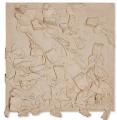
Hassan Sharif (Emirati 1951 – 2016) Wedding A. (Emirati Art Reimagined: Hassan Sharif and the Contemporary Voices)