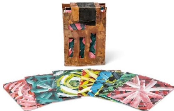
Hassan Sharif (Emirati 1951 – 2016) Sand Dollar No. 7 (Emirati Art Reimagined: Hassan Sharif and the Contemporary Voices)