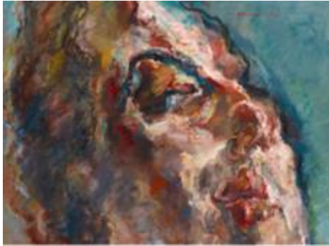
Marwan Kassab-Bachi Syria, 1934–2016 Head , c.1975-76 (Kawkaba: Highlights from the Barjeel Art Foundation)

Kawkaba: Highlights from the Barjeel Art Foundation. Kawkaba, 'constellations' in Arabic, is a loan exhibition of 100 masterpieces from the Barjeel Art Foundation which was created in 2010 by Sultan Soud Al Qassemi. This exhibition, assembled from works across the region, pays homage to the rich artistic diversity of the Arab world, resonating with a myriad of artistic voices from the Middle East and North Africa. 'Kawkaba', a gender-balanced exhibition, magnifies the vibrant tapestry of Modern Arab art, shedding light on both regionally celebrated and underrepresented artists. This exhibition is a window into the soul of the Arab world, revealing an exploration of the region's richness while paying tribute to its unwavering resilience and boundless creativity. 'Kawkaba' invites visitors to marvel at the unique collection of the Barjeel Art Foundation and partake in a transformative artistic and cultural journey into the Arab World.