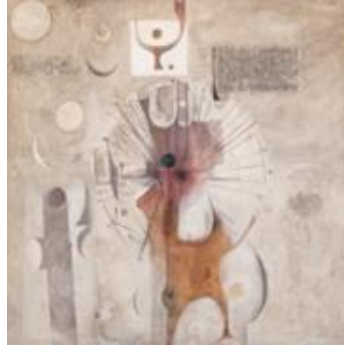
Ibrahim El-Salahi Sudan, b.1930 The Last Sound , 1964 (Kawkaba: Highlights from the Barjeel Art Foundation)