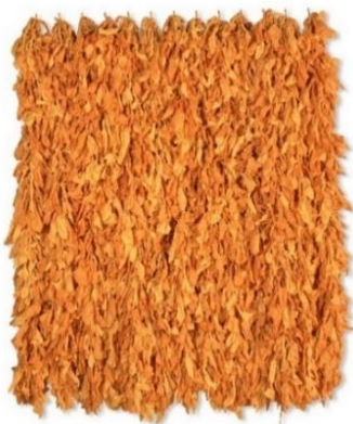
Hassan Sharif (Emirati 1951 – 2016) Cloth 2 (Emirati Art Reimagined: Hassan Sharif and the Contemporary Voices)