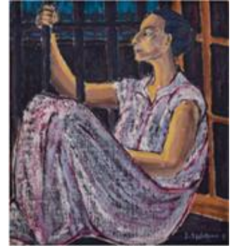
Inji Efflatoun Egypt, 1924–1989 Dreams of the Detainee , 1961 (Kawkaba: Highlights from the Barjeel Art Foundation)